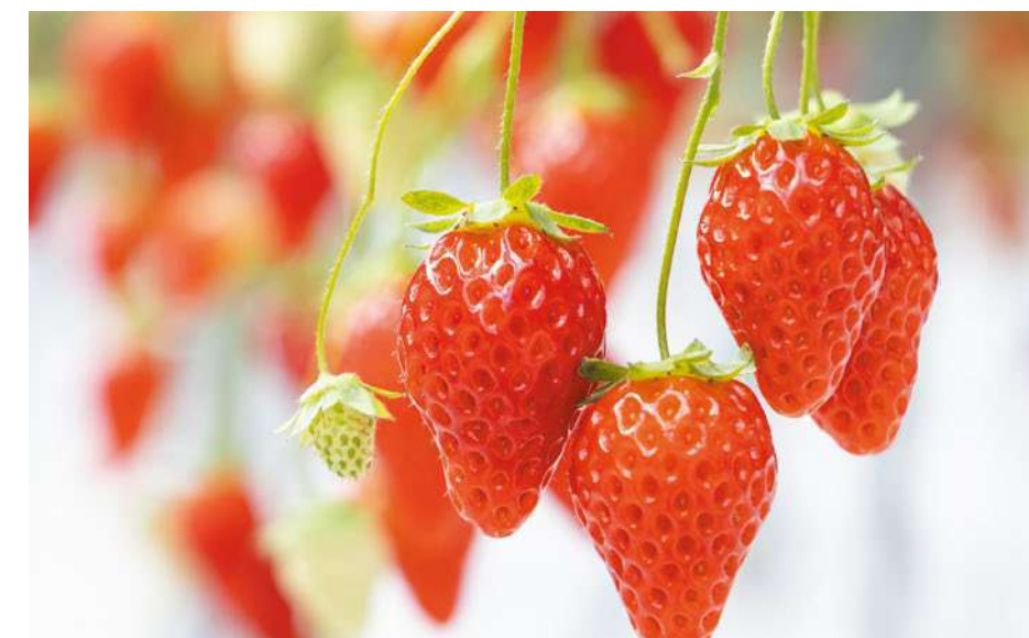
#StrawberryPicking Strawberries 08