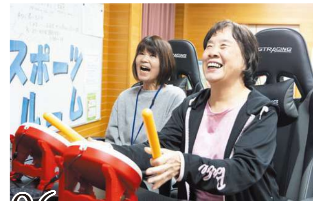
06 espo Ishigase—Your Local eSports Hub