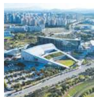
Hongseong County, South Korea