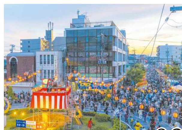
Kyocho Summer Festival #KyowaTheCityOfGoldMedals