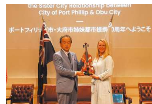
12 City of Port Phillip, Australia Celebrating 30 Years of Sister City Friendship