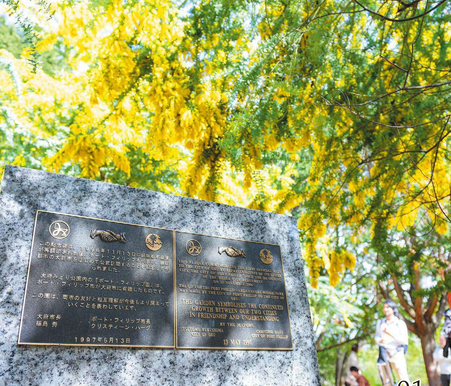
#PortPhillipGardenAustralia #EstablishedIn1997 #SymbolOfFriendshipBetweenTheTwoCities