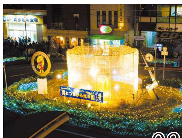
Kyowa Station Illuminations 02