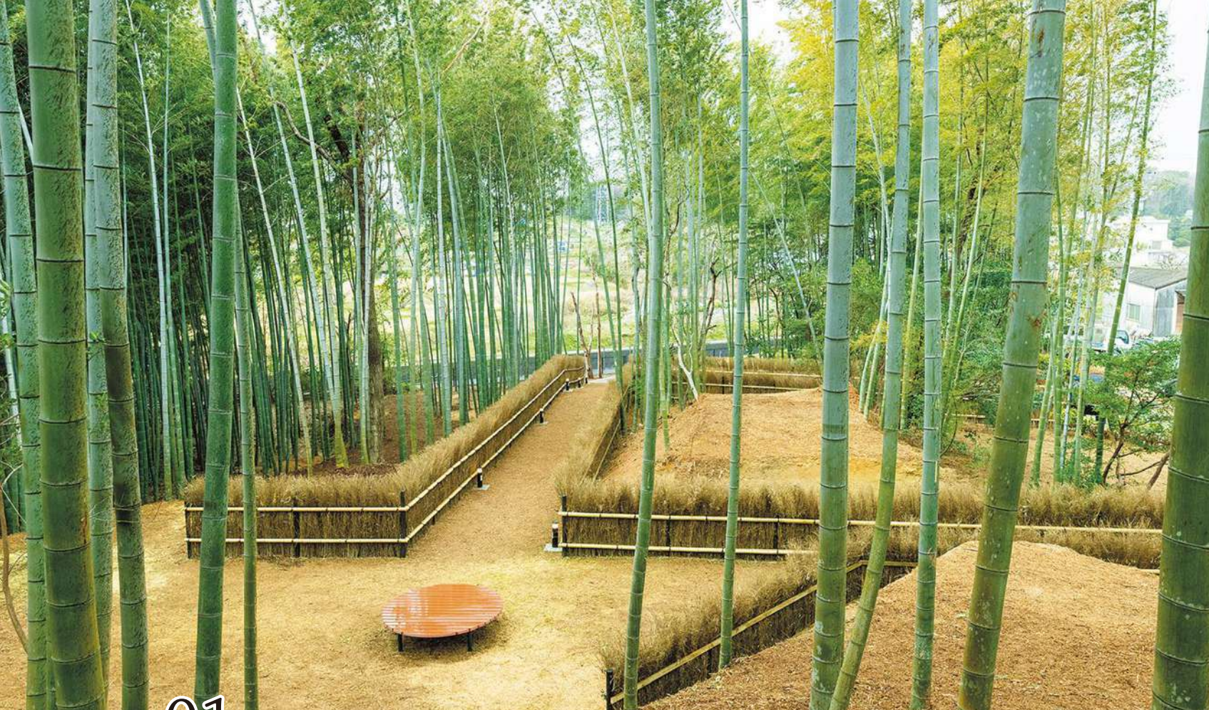
01 Yatogawa Bamboo Path #APlaceOfPeaceAndQuiet #ARefreshingEscapeFromTheHeat