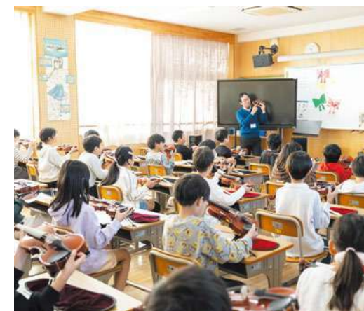
#NervousButExcited #FirstTimePlayingViolinInYear4 #TwinkleTwinkleLittleStar