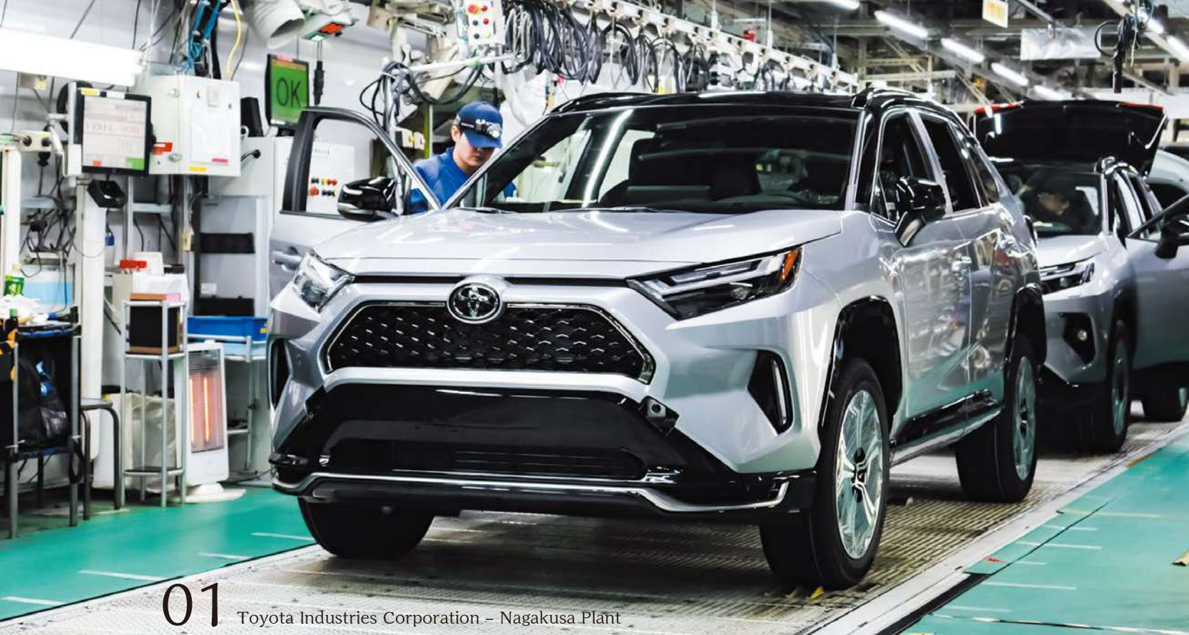
01 Toyota Industries Corporation – Nagakusa Plant #RAV4 #LovedInOver180Countries