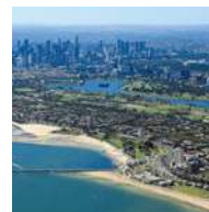
City of Port Phillip, Australia