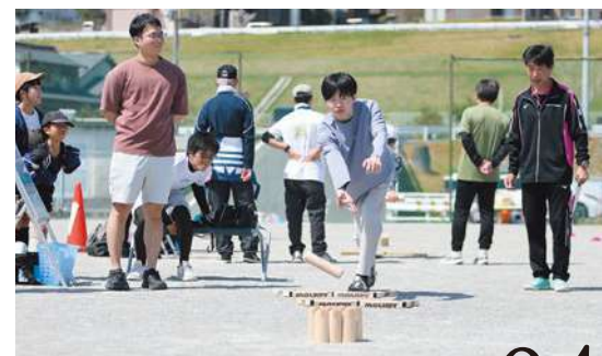
1st Community Mölkky Tournament