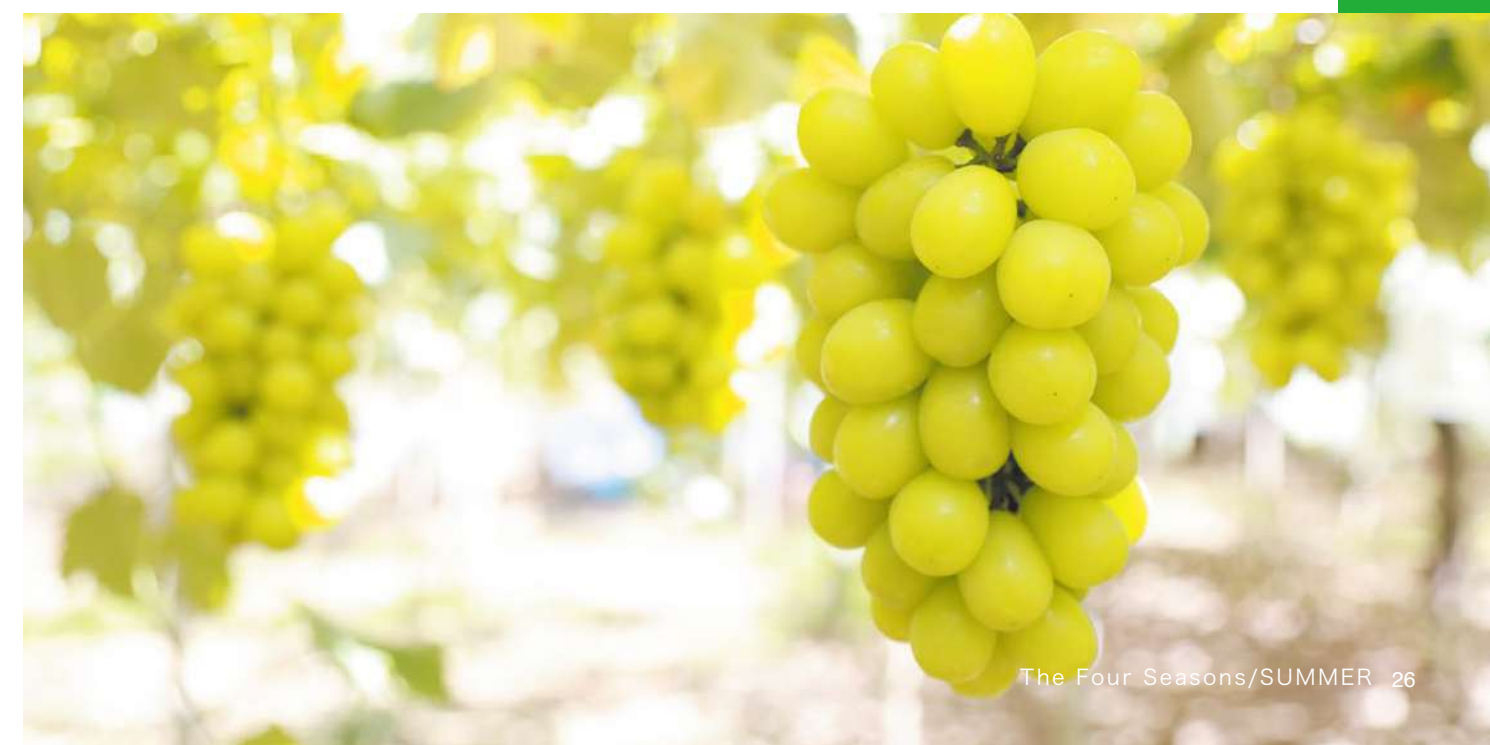
The Four Seasons/SUMMER 26