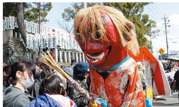
#TraditionalRitualSinceTheMuromachiPeriod #OfferingOfSacredDoburokuSake #RedFacedShoyoSpirit