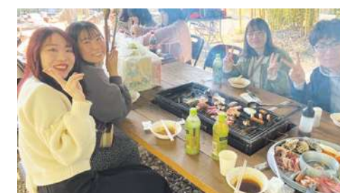
Youth Social Mixer