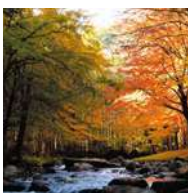
Shinshiro City (Tsukude District), Aichi Prefecture