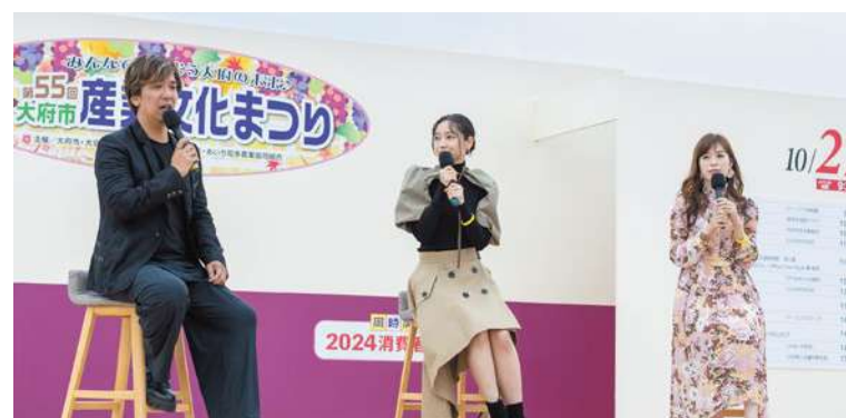
#MajorAutumnEvent #FunForAllAges #YokoneAndKitaoFestivalFloatsGatherOnceEveryFiveYears