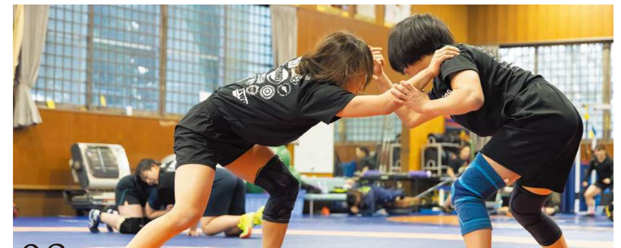
08 Shigakkan University Wrestling Team