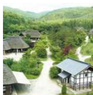
Tono City, Iwate Prefecture