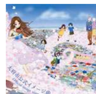
※Students of Obu Higashi High School designed the CD jacket.