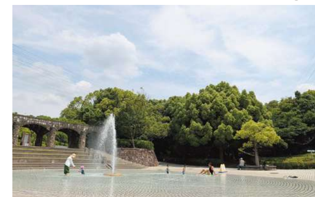
Obu Midori Park 05