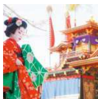
Nagahama City, Shiga Prefecture