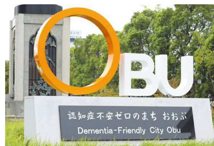
Obu Orange Ring Monument