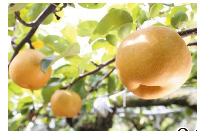
Jumbo Pear-Niitaka Variety