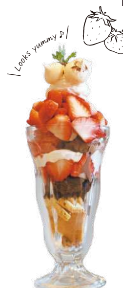
#KURUTOObu #WinterAndSpring VarietiesAvailable