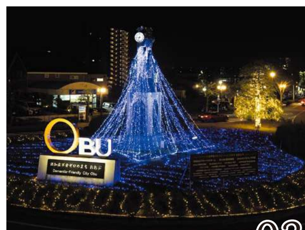
Obu Station Illuminations 03