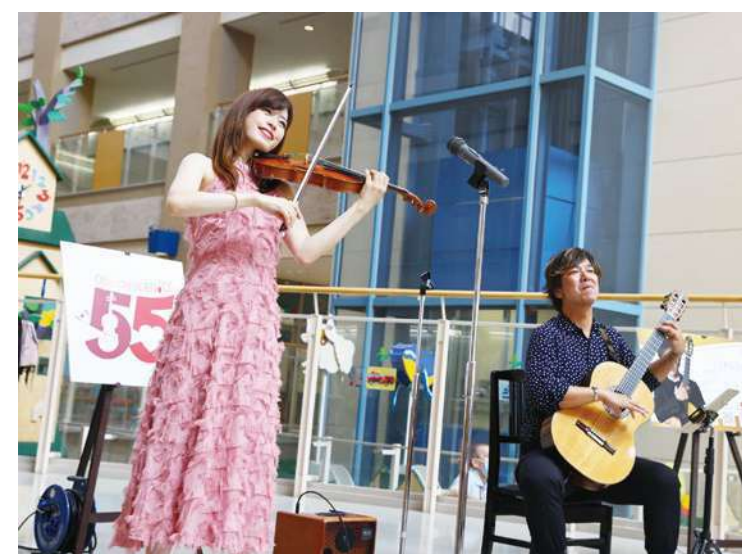
Music that comforts little hearts