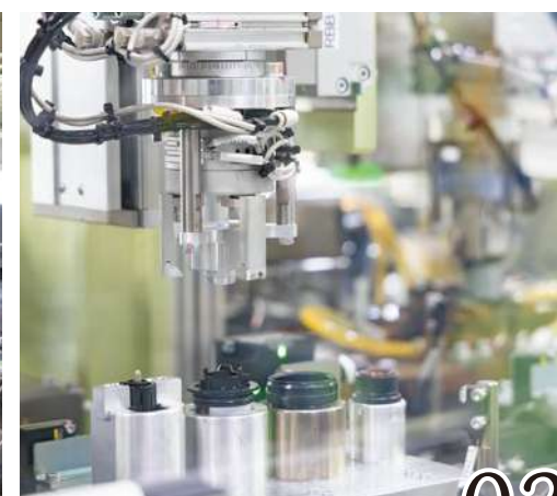
Aisan Industry Co., Ltd.