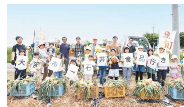
Onion Harvesting with Ishii Foods Co., Ltd. and Kids' Vegetable Sommeliers