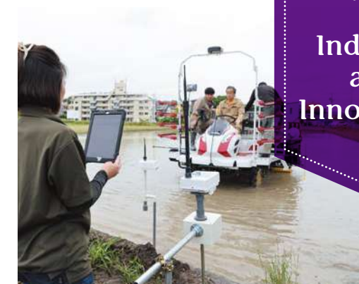
#EcoFriendlyRiceFarming #SmartAgriculture #OrganicVillageInitiative