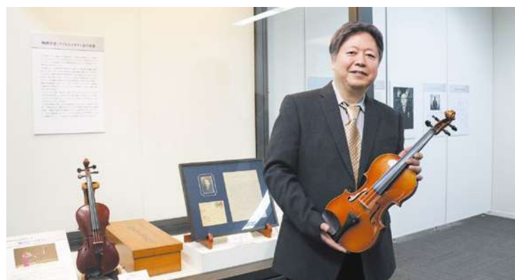
#ViolinDonatedByYukihideTakekawa #LetterFromEinstein #TheGeniusOfMasakichiSuzukiOnDisplay