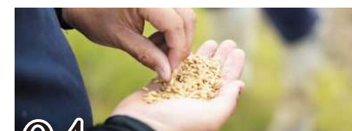
04 Obu-nic School Lunch Rice Production #ObuOnionsHeadToDinnerTables #Meatballs #OffToKyotanbaFactory