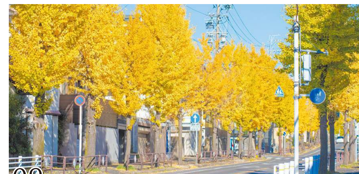
09 Kyowa Yume Street Ginkgo Trees