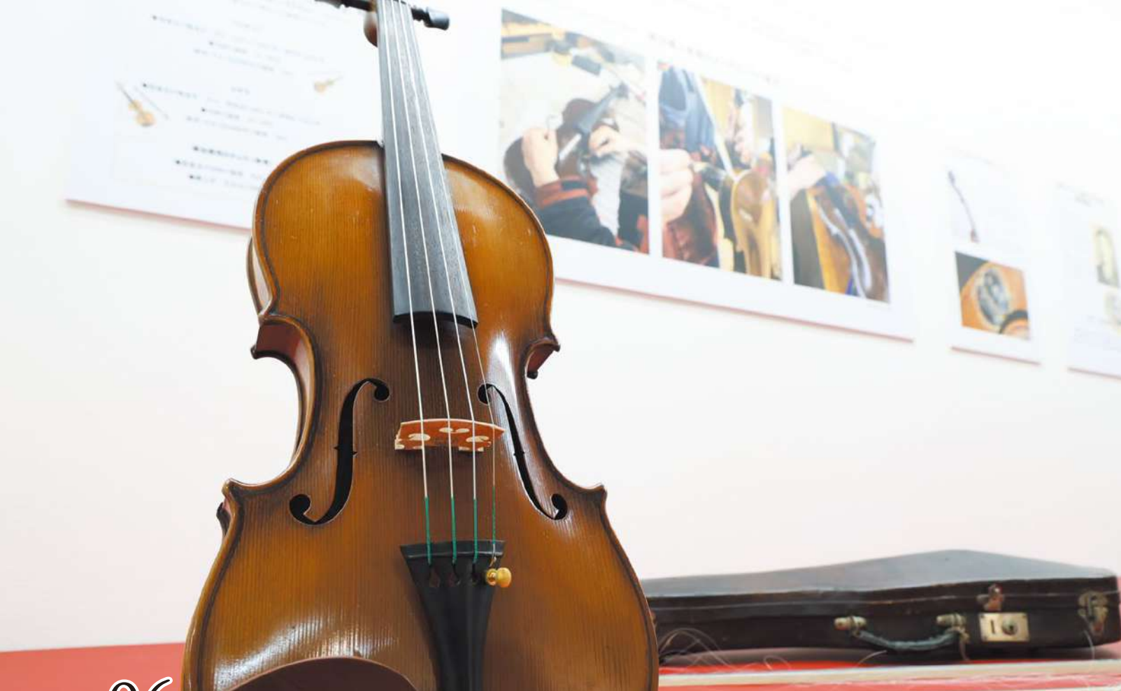
06 Special Exhibition: Kenji Miyazawa and Music #ViolinsAndViolasConnectedToKenjiMiyazawaOnDisplay #InstrumentsComeHomeToObuAfterNearly100Years