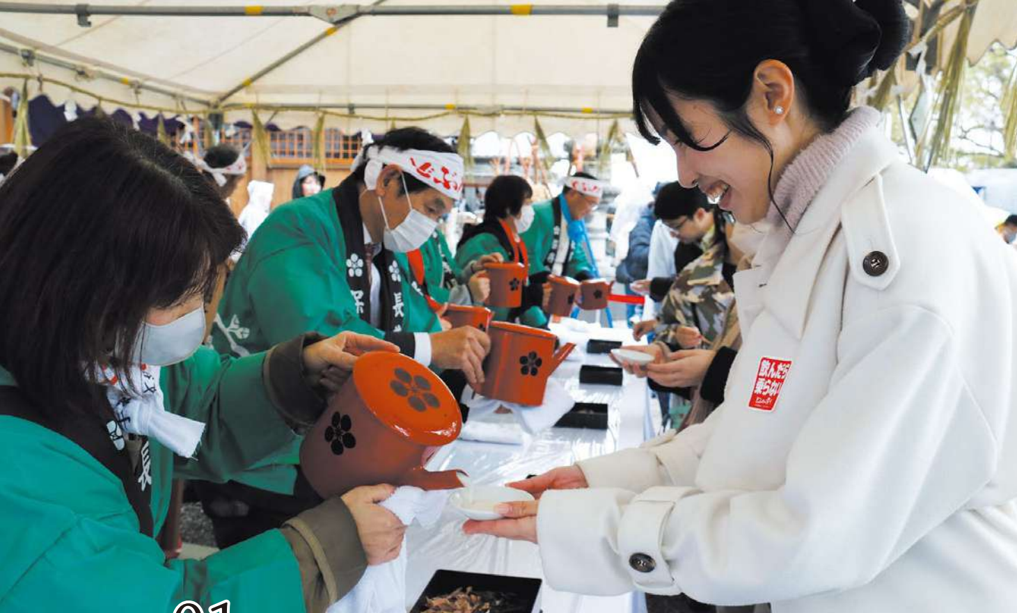
01 Nagakusa Tenjin Shrine Doburoku Festival