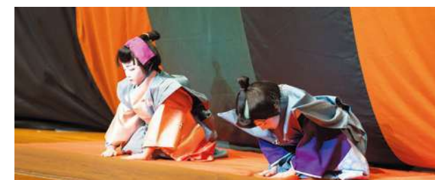
Obu Children's Kabuki