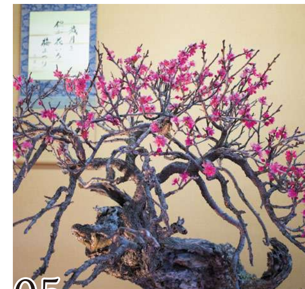
05 Obu Plum Bonsai Exhibition #AnEarlySignOfSpring