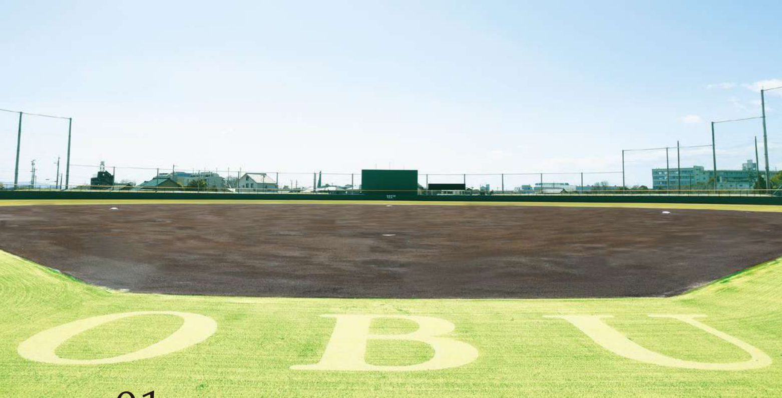
01 Obu Baseball Park #WouldLoveToHitAHomeRunHere #TheNextProsMightStartHere