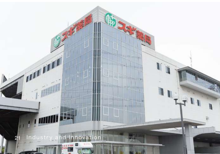
03 Sugi Pharmacy Co., Ltd.