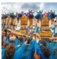
Niihama City, Ehime Prefecture