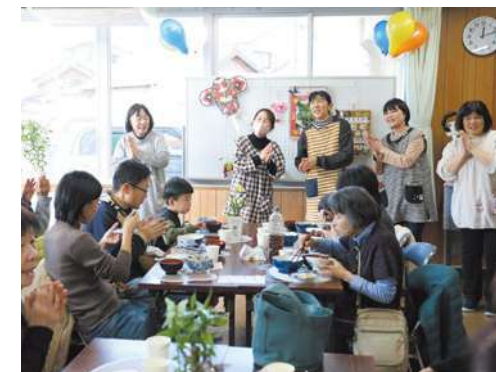
All-Generations Community Salon

#GreatFoodGreatCompany #ConnectingCommunitiesOverMeals