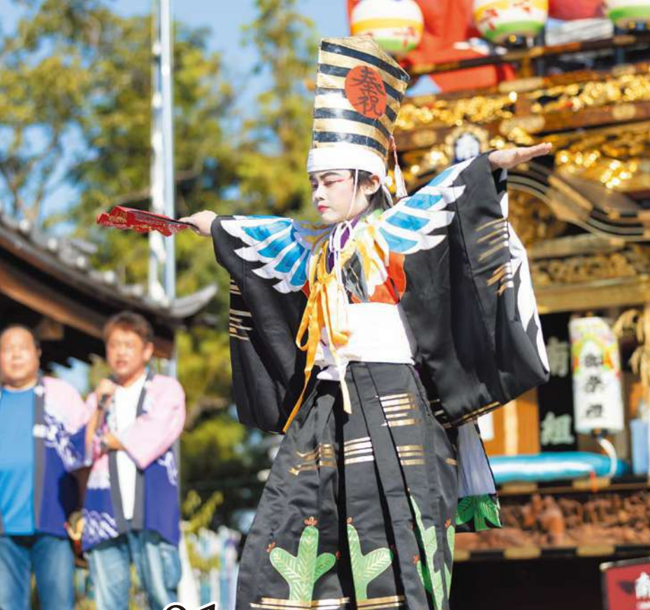
01 Yokone Fujii Shrine Festival-Sanbaso Festival Float for Fujii Shrine Celebration